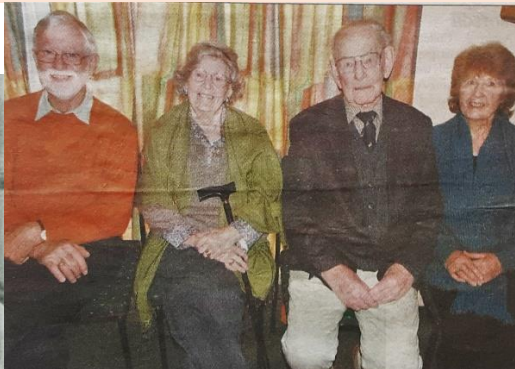
Thanked for her service to UCHRS and WGG at farewell afternoon tea in June 2010