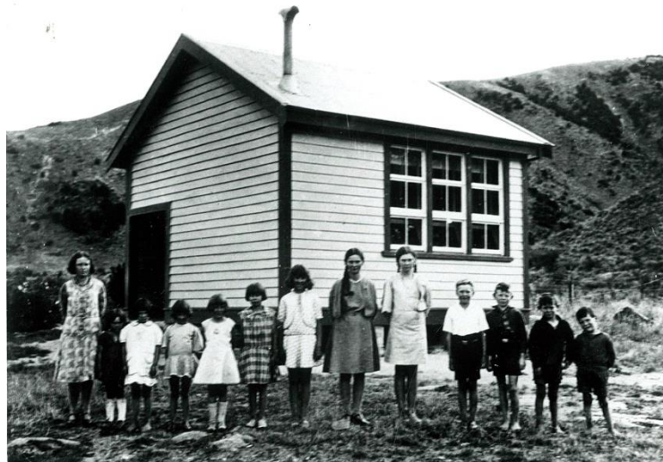
QUEENSBERRY SCHOOL IN 1931 19