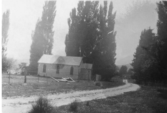
Cardrona Miners Hall that became St Bridget's Church