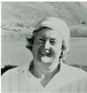
Book Committee member