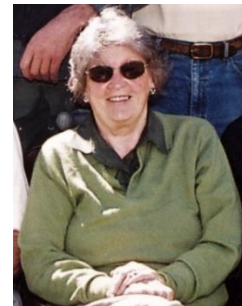
UCHRS Committee Life member