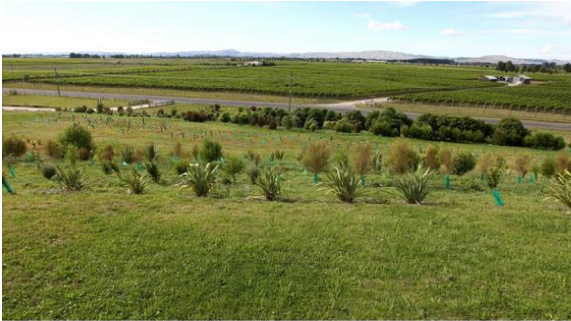
The Roy's Hill Reserve in 2012, with earlier plantings showing signs of growth.

It is currently known as the Roy's Hill Reserve and is managed by the Hawkes Bay Council.